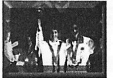
135. Winning means more than a score.