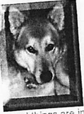
003. Even sad things are important.