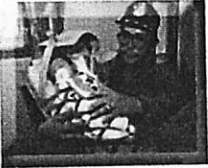
152. Fathers have incredible dreams for their sons.