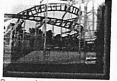
138. Some places have a magic all their own.

a life lesson; a universal (debateable) truth; AKA a thematic statement