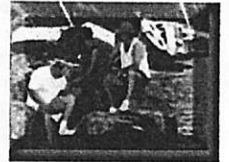
46. You can't know how rich you are until you lose everything.