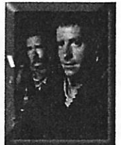
211. Betrayal by a friend cuts more deeply than an attack by an enemy.