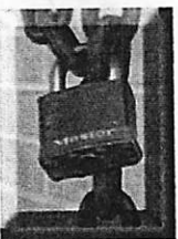
136. People create their own punishments.

Truisms: Life lessons, thematic statements, usually in third person present tense.