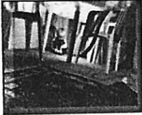
124. Life has many kinds of tests.