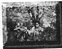
001. Our families help make us who we are.