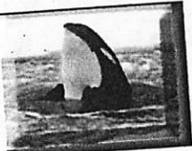
122. Sometimes ideas that seem crazy work best.