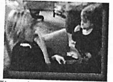
106. There is no higher love we can show another person than to teach them something.